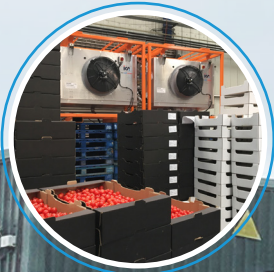
Low Temperature Fan Coil units for food storage