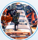
R&D material & High-tech components