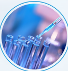
Pharmaceutical, Bio-life & Healthcare