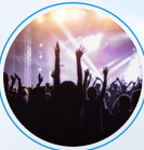
Festivals, Events, Exhibition centers