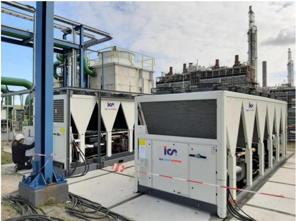
Above: Two new chillers installed at a manufacturing plant in The Netherlands to support their latest technology developments

Thanks to the FLEX contract, the industrial plant moved forward with their production transformation and benefited from maximum flexibility and easy switching to a more applicable equipment along with minimised running costs, full maintenance and warranty cover.