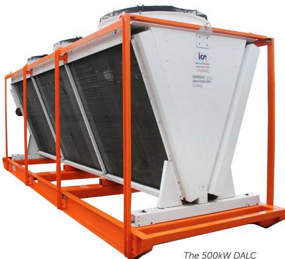
The 500kW DALC

A whole rental fleet of high efficiency (Class A) dry air coolers is available from ICS Cool Energy, backed by a full on site installation service, year-round 24/7 helpline and technical support from the industry leaders. There's a full range of hire solutions as well as sales and service for all types of industries and applications.