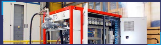
Modular Temperature Control Units