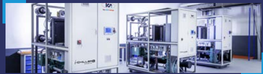
Low Temperature Chillers -40°C