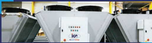
Ambient Cooling Adiabatic & Dry Air Coolers