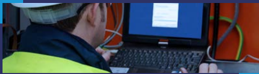
Full Turnkey Solutions: Design, Installation & Commissioning