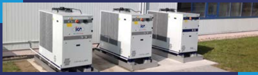
Packaged Process Chillers