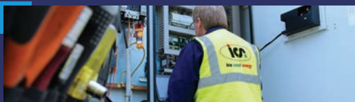
Service Breakdowns, Service, Planned Preventative Maintenance, Water Analysis, Glycol, Spare Parts and Energy Enhancements