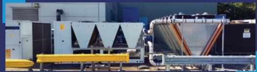
Free Cooling up to 80% savings