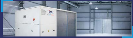
Process Chillers Multiscroll & Screw