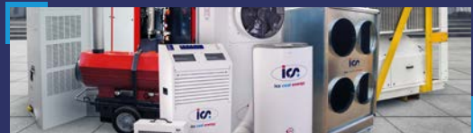
HIRE Chillers, Dry Air Coolers, Fan Coils, Portable Air Conditioning, Boilers, Calorifiers, Temperature Control Units, Portable Heaters, Contingency Planning