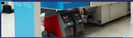
Compact Temperature Control Units